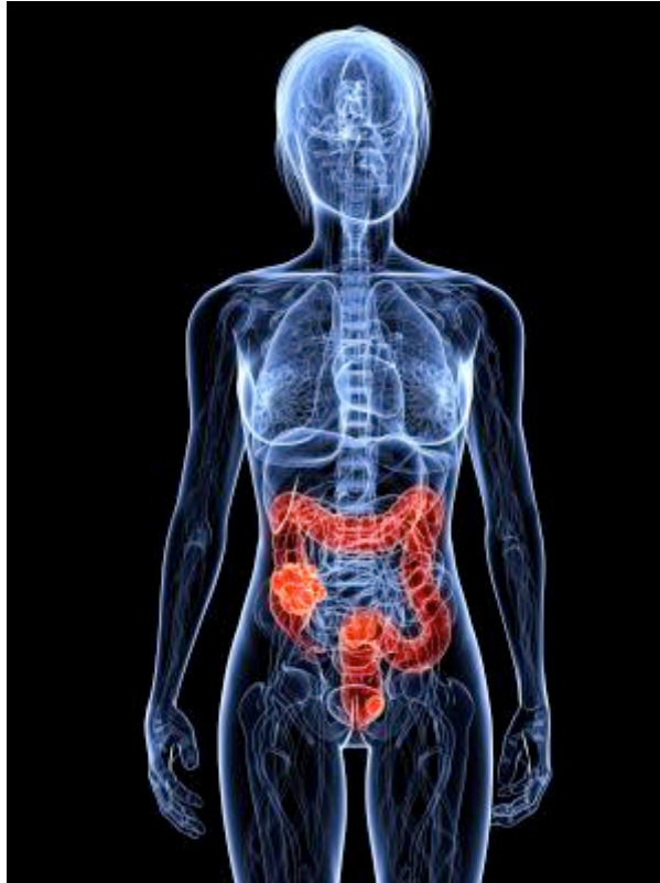
Researchers have found a way to control the stem cell behaviour that causes the spread of CRC

Conventional treatments for CRC sometimes have poor outcomes because by the time the disease is detected, cancerous cells have spread to nearby organs. Tumour cells can lie dormant and undetected for years, until triggered to grow into secondary tumors that then become the cause of death. An Australian study has targeted dormant CRC cells rather than active tumor cells as a treatment option for CRC. Previous research has already established that crypt base stem cells (CRCs) help to regenerate the epithelium or lining of the gut when it becomes damaged. To do this, these cells allow "Wnt" signals through their surface receptors into their cell interior. The receptors that allow passage to Wnt signals are called "Frizzled," and there are 10 different types. This study has characterized the particular Frizzled receptor, Frizzled7, which allows passage to Wnt signals in the CRCs to trigger cancer. Researchers have found that if Frizzled7 is knocked out while cells are in a dormant state, they are not able to make the tumor grow. The consequences of these findings represent a shift in the targeted management of cancers. Subsequent steps will involve finding a way to target Frizzled7 and develop antibody treatments that work with current therapies.