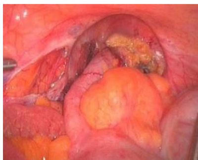
A mucinous colorectal tumour.

Adenocarcinoma is the most common type of colorectal cancer and has two subtypes, signet ring cell and mucinous adenocarcinoma . "Adeno-" is a prefix that means "gland". In general, glands secrete things and are classified as endocrine or exocrine. Endocrine glands secrete things into the bloodstream, like hormones. Exocrine glands secrete things that go outside of the body, like mucus and sweat. A carcinoma is a malignant tumour that starts in epithelial tissue. When the two words are put together, you get "adenocarcinoma," which means a malignant tumor in epithelial tissue, specifically in a gland.